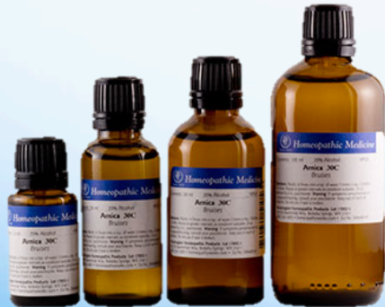
Single remedies in dilution form, available in 15ml, 30ml, 50ml, and 100ml (shown above), in 20% or 87% alcohol.

We strive to be a homeopathic one-stop shop! We carry a wide range of homeopathic medicine to meet the needs of practitioners, veterinarians, retailers, pharmacies, and even the novice to homeopathy!