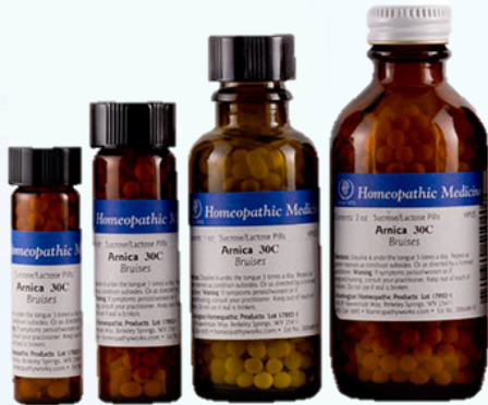
Single remedies on pellets available in 2 dram, 4 dram, 1 oz, and 2 oz (shown above).