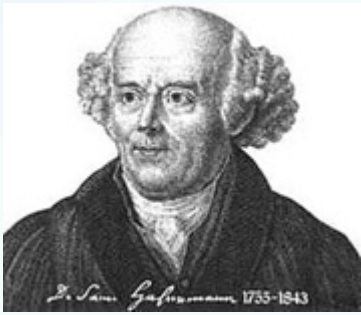
Samuel Hahnemann (1755–1843) Founder of Homeopathy