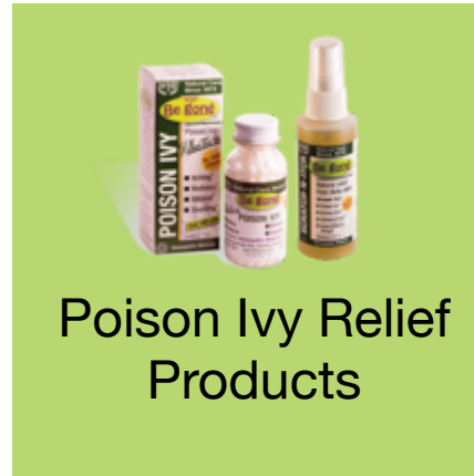
Poison Ivy Relief Products